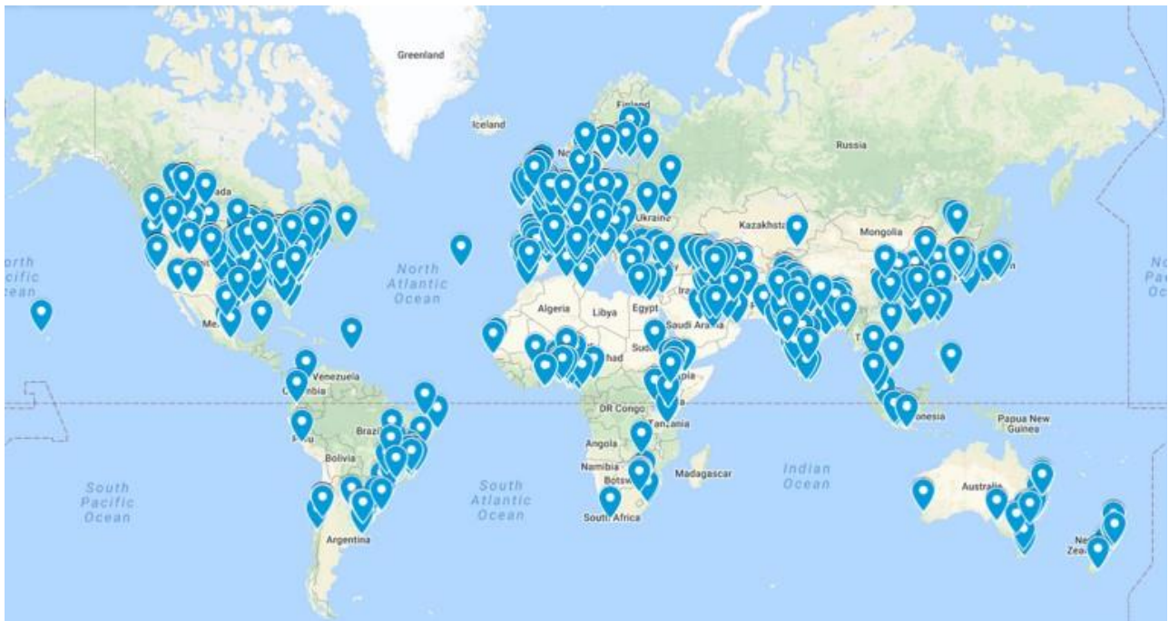
Figure 1. Worldwide distribution of ~3,000 members on AnGenMap server and/or mail list.