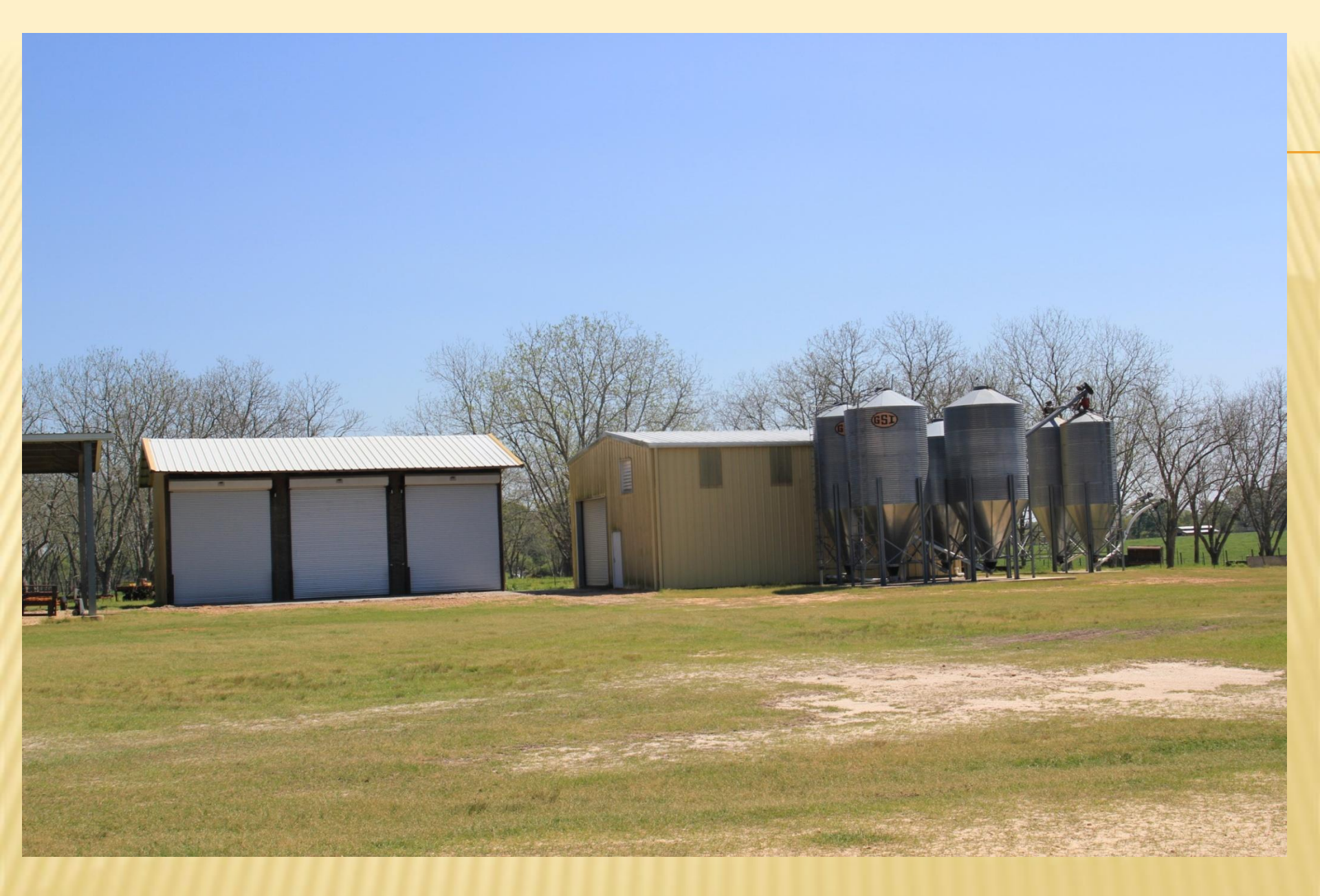
Commodity Storage & Feed Mill White Sands, MS