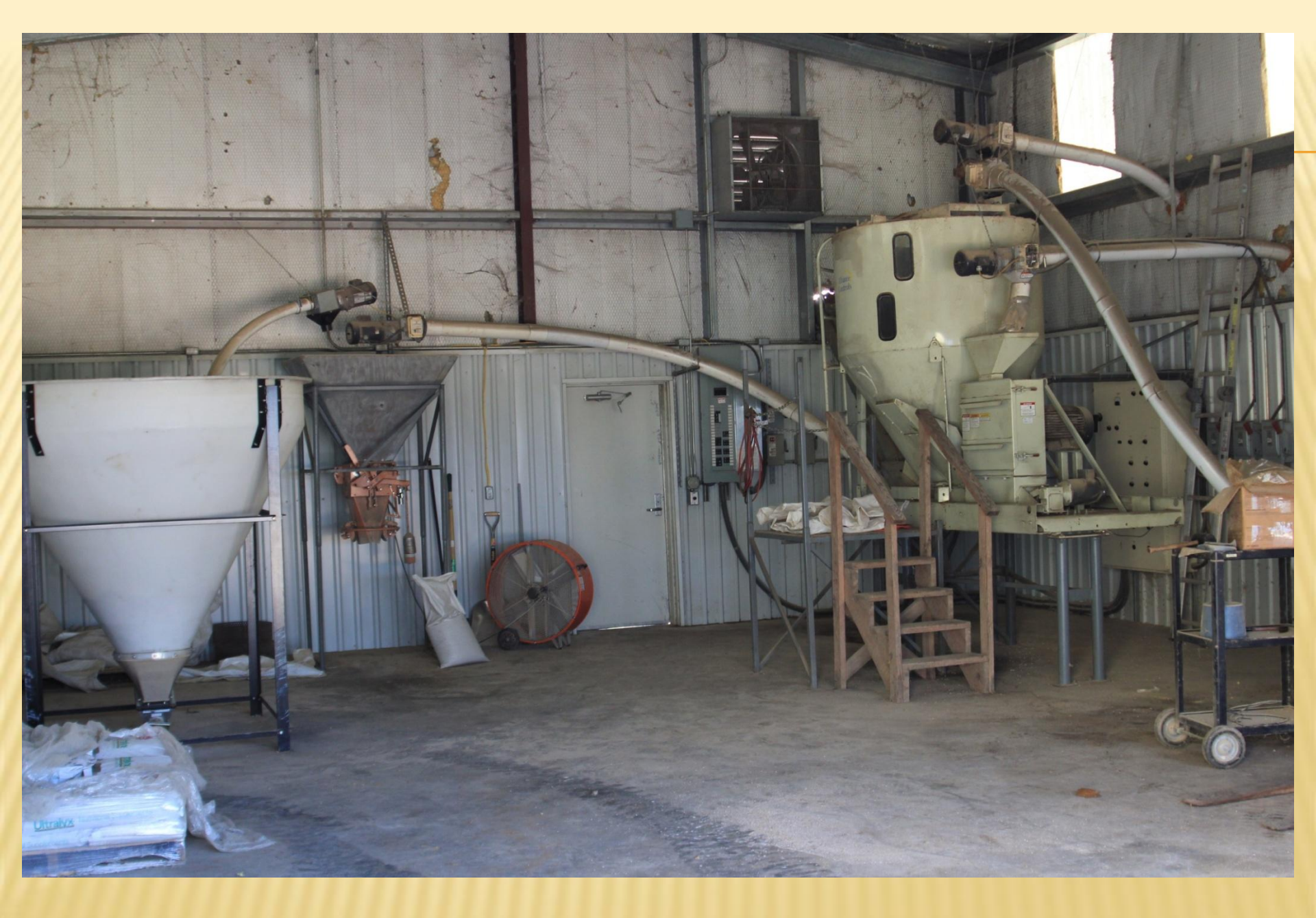
Feed Mill—White Sands, MS