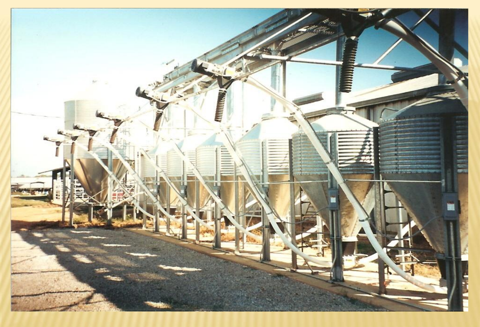
Multiple Bins for Storing Research Diets