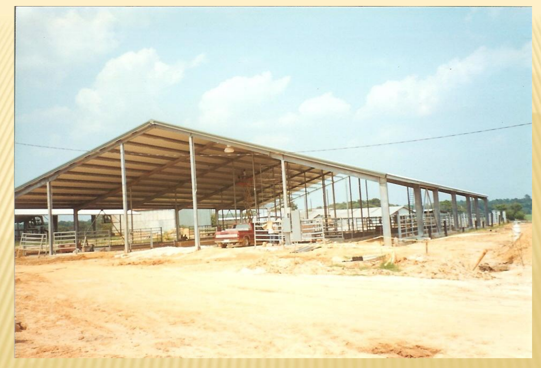
Freestall Barn Under Construction Franklinton, LA