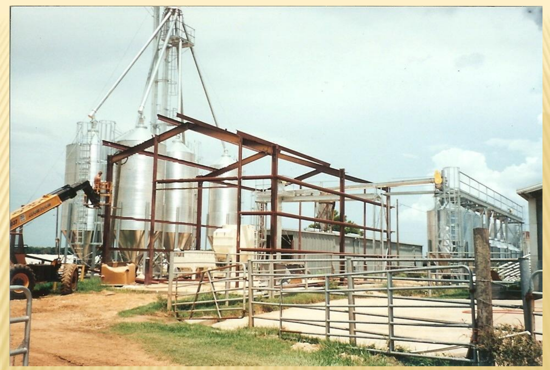
Feed Mill Under Construction - Franklinton, LA