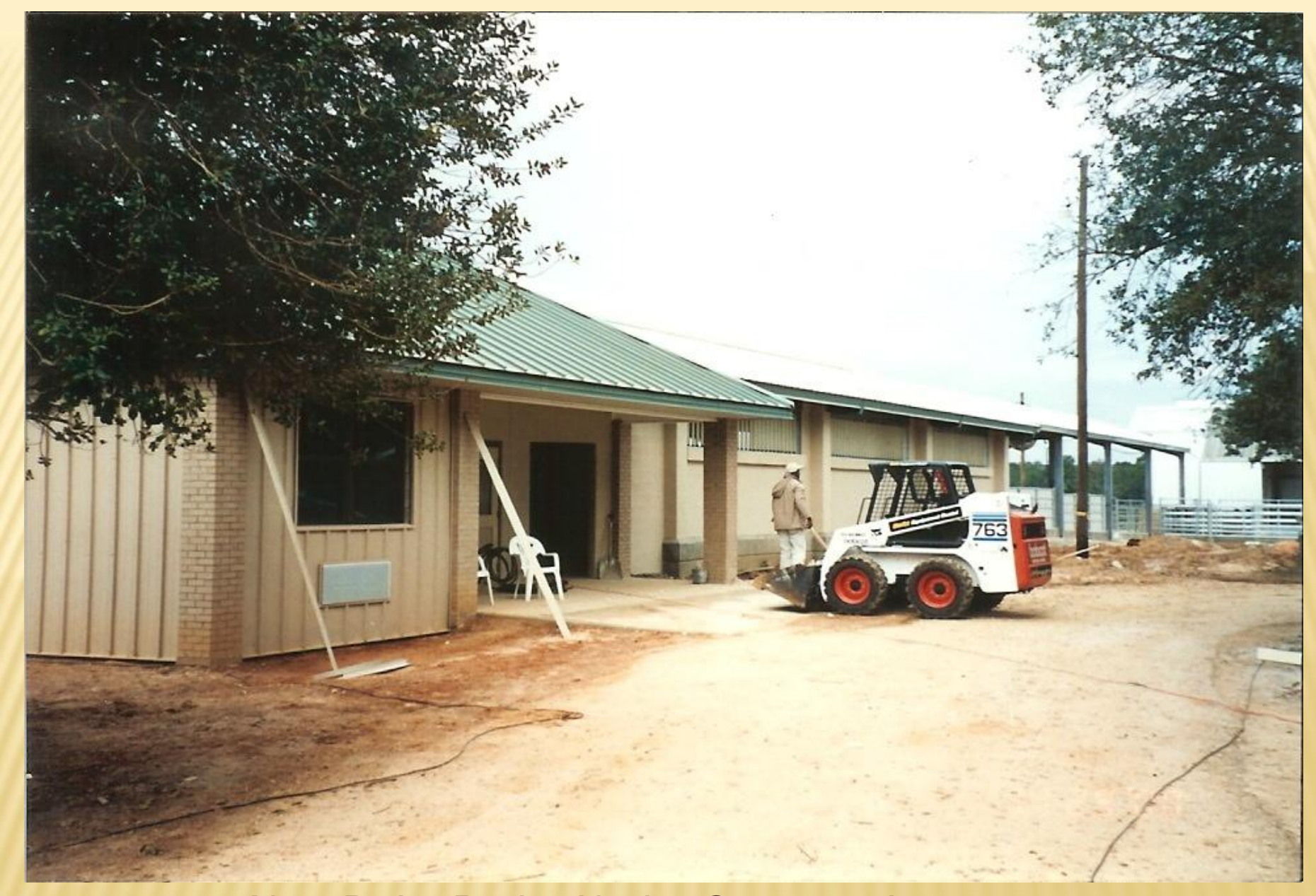
New Dairy Parlor Under Construction Franklinton, LA