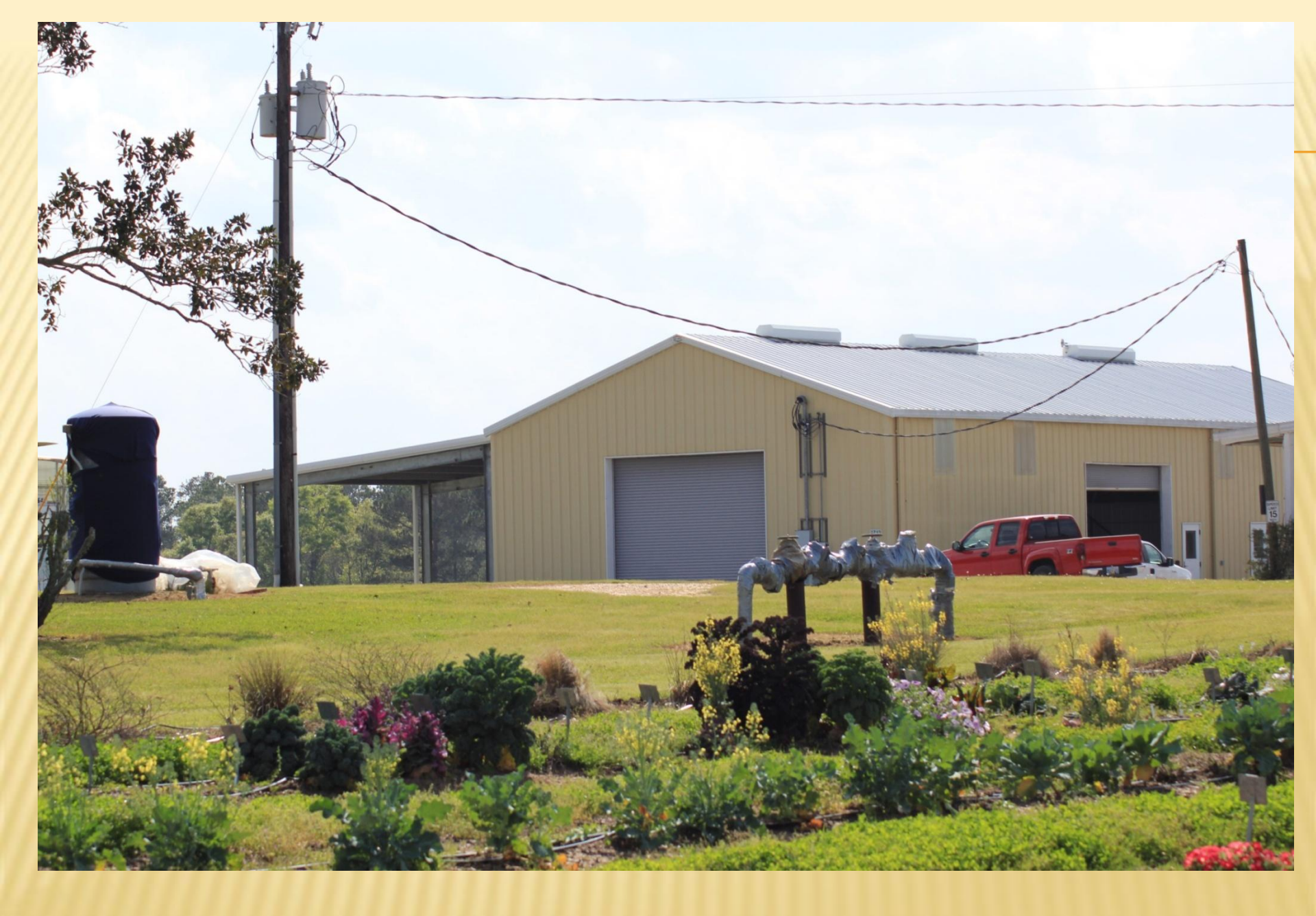
Forage Lab—Poplarville, MS